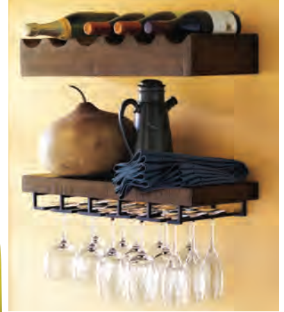
Rustic wood entertaining shelves, $75-$85, Pottery Barn, Westfield UTC