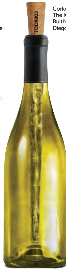
Corkcicle, $25, The Kitchery at Bulthaup San Diego, 777 J Street