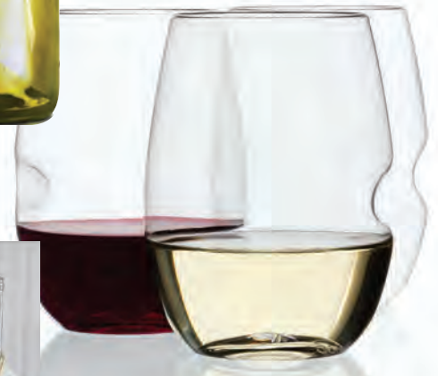
Govino "Go Anywhere" wine glass, $13 for set of four, Mixture, 2210 Kettner Boulevard