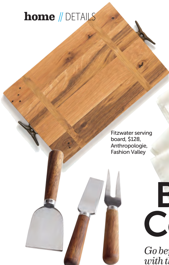
Fitzwater serving board, $128, Anthropologie, Fashion Valley