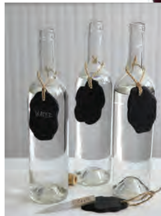
Slate tags, $18 for set of four, The New General Store, thenewgeneralstore.com