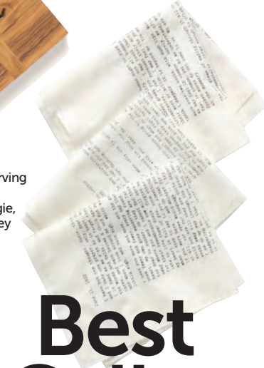
Literary Correspondence napkin set, $58, Anthropologie, Fashion Valley